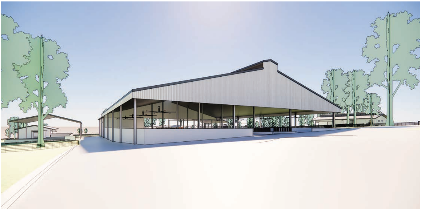
Concept design of the cattle barn