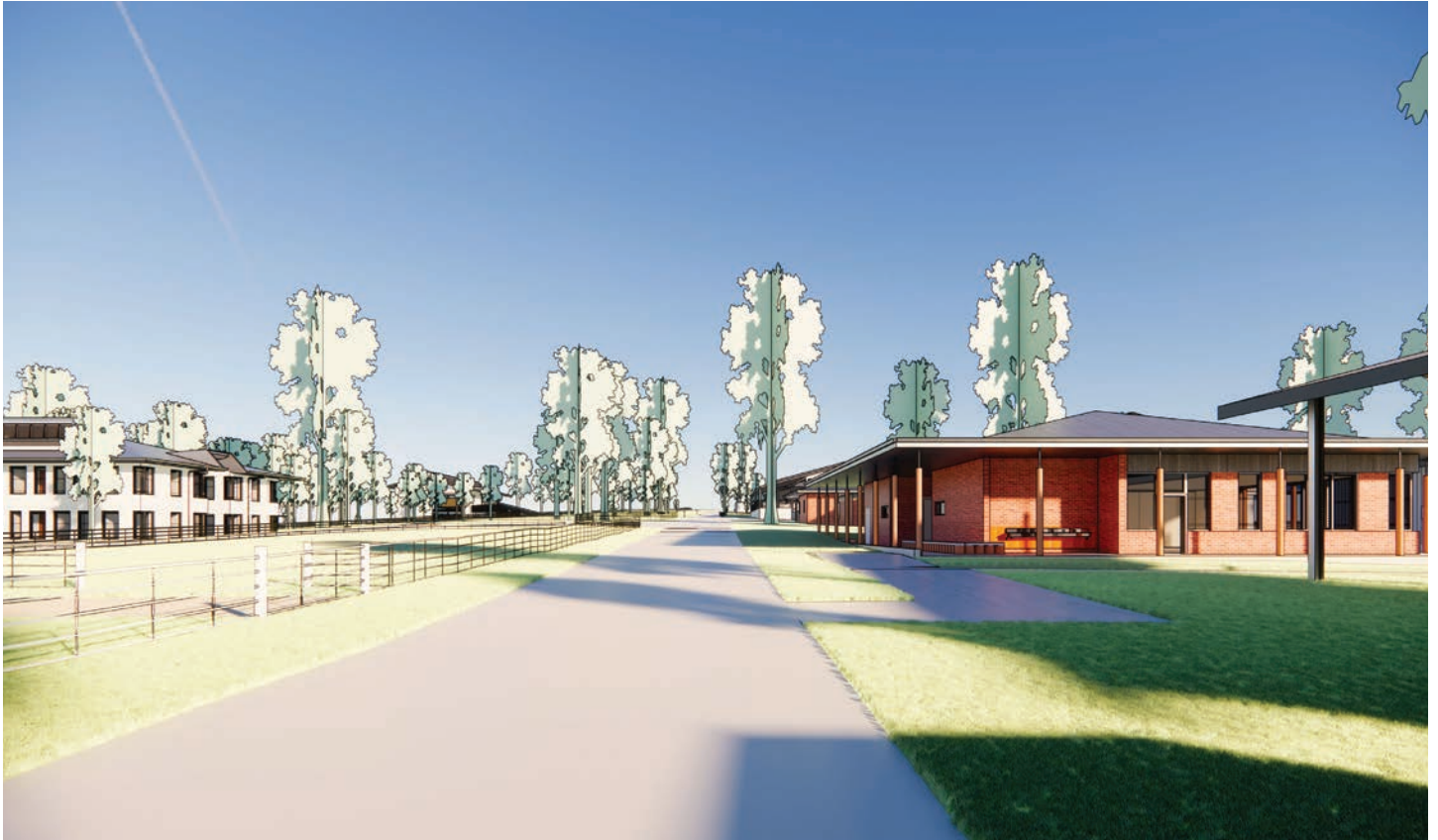
Concept design of the view west down Roy Watts Road, boarding facilities to the south and farm learning hub to the north

Once the detailed design has been completed, construction is expected to start in late 2022, pending planning approvals.